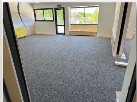
Above: Inside a new Prep-2 classroom

The excitement is mounting as we are now less than a month away from taking possession of the Admin and the Prep – Year 2 buildings. The final touches are being completed inside the rooms and the fencing will begin to be removed this week.